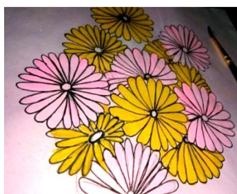
Figure 4. Painting with both beetroot and curcumin ink using a paintbrush.

week and precipitated when stored at room temperature. A moderate odour was detected for the formulations of beetroot, and a strong odour was found in the case of the curcumin formulations during the course of studies. However, the ink strips were found to maintain a low odour throughout the study. The beetroot formulation 3 has maintained low odour throughout the study, while in the case of formulation 4 of curcumin, the odour was low from the 1st to the 14th day and moderate on the 28th day at room temperature. When these two formulations were stored in a refrigerator, a little odour was detected till the 28th day. In summary, Formulation 3 of beetroot and Formulation 4 of curcumin were found to be the best among the other formulations because these two formulations have shown excellent colour stability, low odour, and lower drying time. Therefore, the two formulations can be used for writing and painting ( Figure 4 ) using an ink pen and paintbrush effectively, while desired results were not achieved using other formulations due to low colour stability.