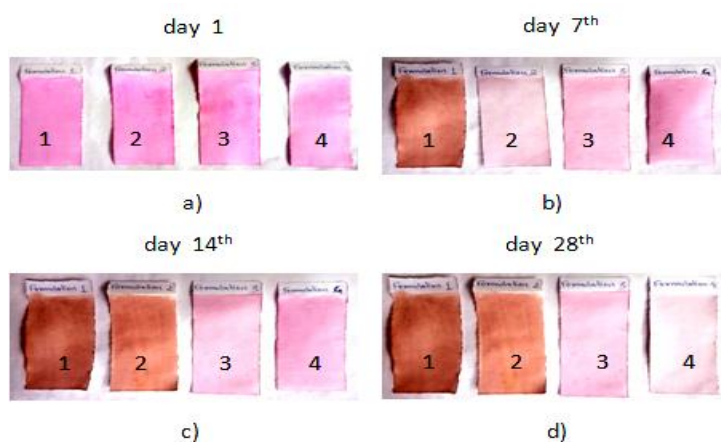
Figure 1. Ink strips of the four beetroot formulations on a) day 1, b) day 7, c) day 14, and d) day 28.

The study of the lightfastness property of all ink formulations has shown that the dark pink colour of beetroot pigments ( Figure 1 ) and the intense yellow colour of pigments in the ink strips ( Figure 2 ) gradually change their vibrant colour over time, except for formulation 3 of beetroot and formulation 4 of turmeric. All other ink formulations of beetroot and turmeric turned into a light brown colour, while the two best formulations had almost no colour change over the days.